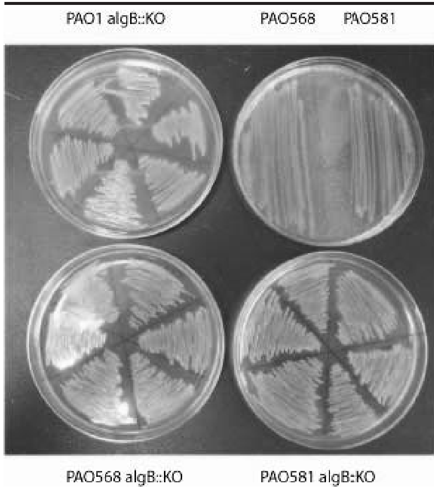
Fig 2. Effect of the inactivation of the algB gene on the mucoid colony shape in mucoid P. aeruginosa strains PAO1, PAO568, and PAO581. The picture shows the inactivation of the algB gene in PAO568 and PAO581 makes the bacterium change from a slimy into a non-slimy form.