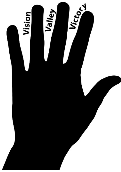
Fig 1.2. Vision, Valley, Victory

icy support and advocacy for vulnerable populations). Each group, along with all elements of the W4W initiative, developed its work through the three major stages of partnered research, Vision, Valley, and Victory, which are explained in more detail below. Although each of these steps had been developed and implemented in prior HAAF projects, the W4W program became a flagship initiative for integrating the approach with more traditional health services research approaches and for developing a language to share the model equally with community, academic partners, and friends. As W4W progressed, a similar form of the model was used in other initiatives involving HAAF and various community and academic partners. A listing of those initiatives to date, showing the history of the development of the model, is included in the appendix to this guidebook.